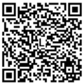
Prospectus and Financial Reports