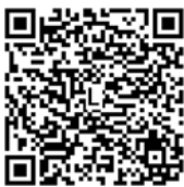
Prospectus and Financial Reports