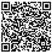
Prospectus and Financial Reports